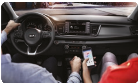
7" colour screen navigation system The multi-language navigation system includes a high-definition 7" TFT-LCD screen and a back-up camera display.

It's amazing how much space, comfort and advanced technology can be packed into such a perfectly proportioned exterior. And the closer you look, the more you'll be impressed. The surprisingly roomy interior, complete with folding rear seats, provides a high degree of versatility. While built-in comfort is enhanced by automatic air-conditioning, heated front seats and the kind of smart connectivity features that are usually associated with much larger cars.