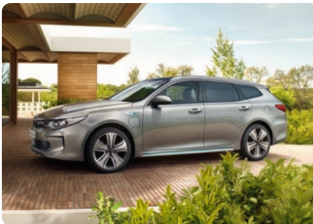
Kia Optima PHEV The plug-in with an extra charge of style

It's the fuel-efficient hybrid with all the style, technology and versatility of a crossover. With an athletic profile that stands out in the urban environment. The parallel hybrid system of the Niro HEV delivers CO 2 emissions as low as 88 g/km, while the Niro PHEV adds an emissions-free electric driving range of up to 58 km.