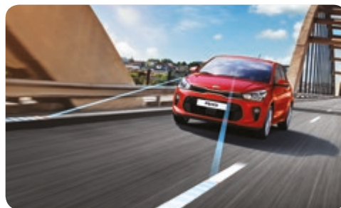
Lane Departure Warning System (LDWS) LDWS uses a camera mounted at the top of the windscreen to monitor lane markings, and alerts you if the vehicle deviates from the lane when the indicator has not been activated.