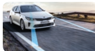
Lane Keeping Assist (LKA)

ASCC maintains the distance to the preceding vehicle by automatically modulating the car's speed. If the vehicle in front slows down, the system will reduce the speed, or even stop the car.