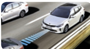
Advanced Smart Cruise Control (ASCC)

If there's no driver reaction prior to a potential collision detected by the FCA, the car brakes automatically to avoid or mitigate an accident.