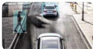
Autonomous Emergency Braking (AEB)

The Forward Collision-Avoidance Assist system detects both preceding vehicles and pedestrians crossing the road and warns the driver if any potential collision is detected.