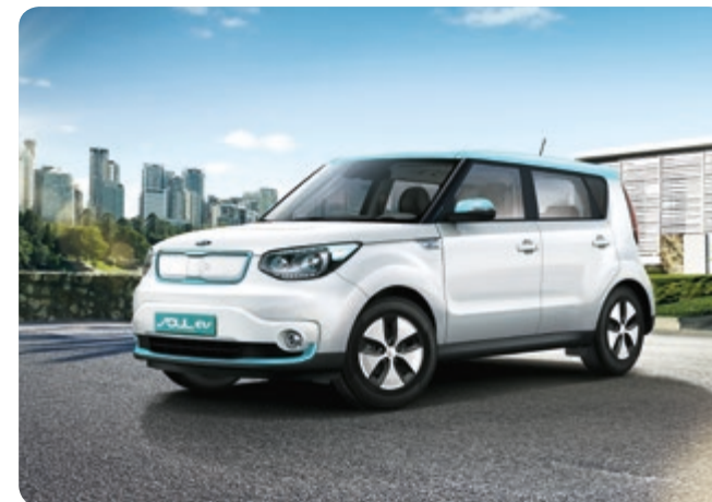
Kia Soul EV 100% electric – 0% emissions

Available in either Sportswagon or Sedan body-styles, the advanced powertrains of the Optima Plug-in Hybrid models shift seamlessly from electric to hybrid mode, delivering optimised fuel efficiency with dynamic performance. It can be charged from a standard domestic socket or public charging station.