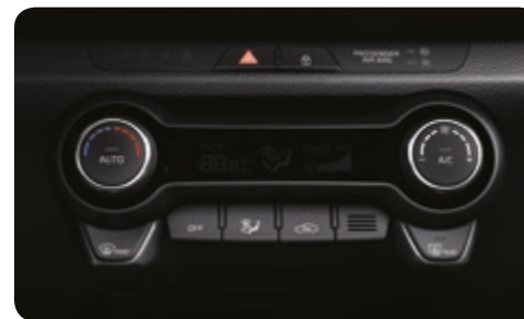
Full Automatic Air Conditioner (FATC) FATC offers set-and-forget functionality, automatically turning the system on and off to maintain the desired temperature in the cabin.