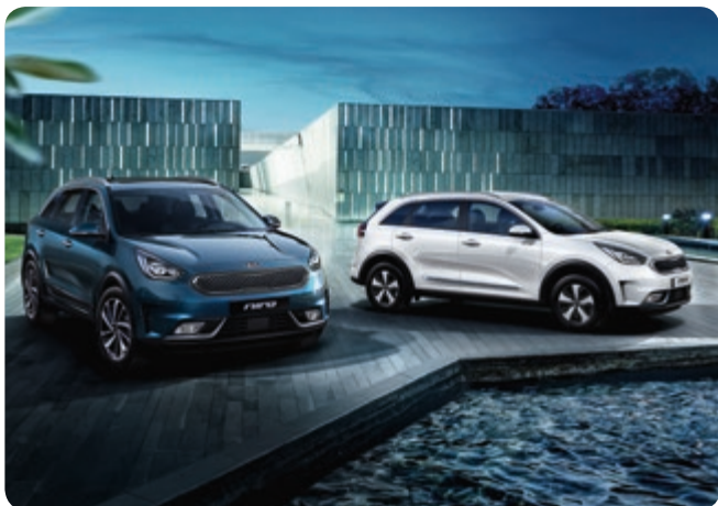
Kia Niro HEV & PHEV The hybrid crossover

It's the fuel-efficient hybrid with all the style, technology and versatility of a crossover. With an athletic profile that stands out in the urban environment. The parallel hybrid system of the Niro HEV delivers CO 2 emissions as low as 88 g/km, while the Niro PHEV adds an emissions-free electric driving range of up to 58 km.