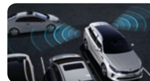
Rear Cross Traffic Alert (RCTA)

No need to worry about drifting out of your lane. The Lane Keep Assist System alerts you and even steers you back into place to keep you exactly where you need to be.