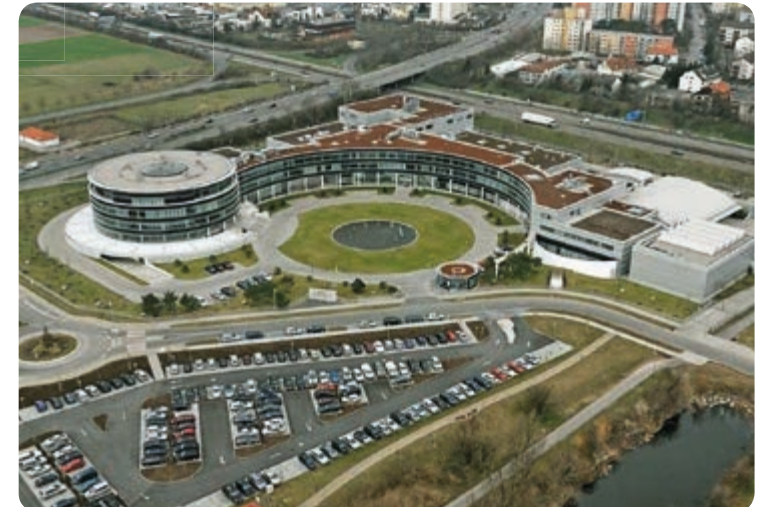
Kia R&D Centre Europe in Rüsselsheim, Germany