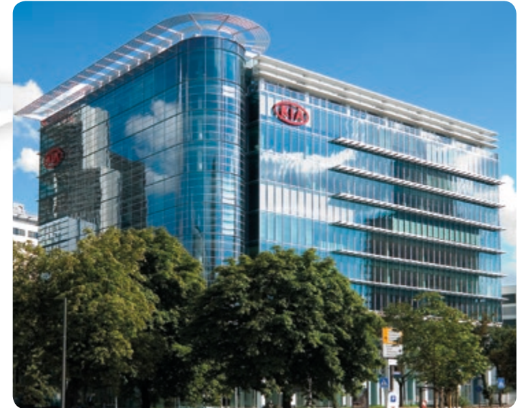
Kia European Headquarters and Design Centre Europe in Frankfurt/Main, Germany