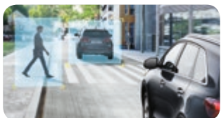
Front Collision Alert (FCA)

The Forward Collision-Avoidance Assist system detects both preceding vehicles and pedestrians crossing the road and warns the driver if any potential collision is detected.