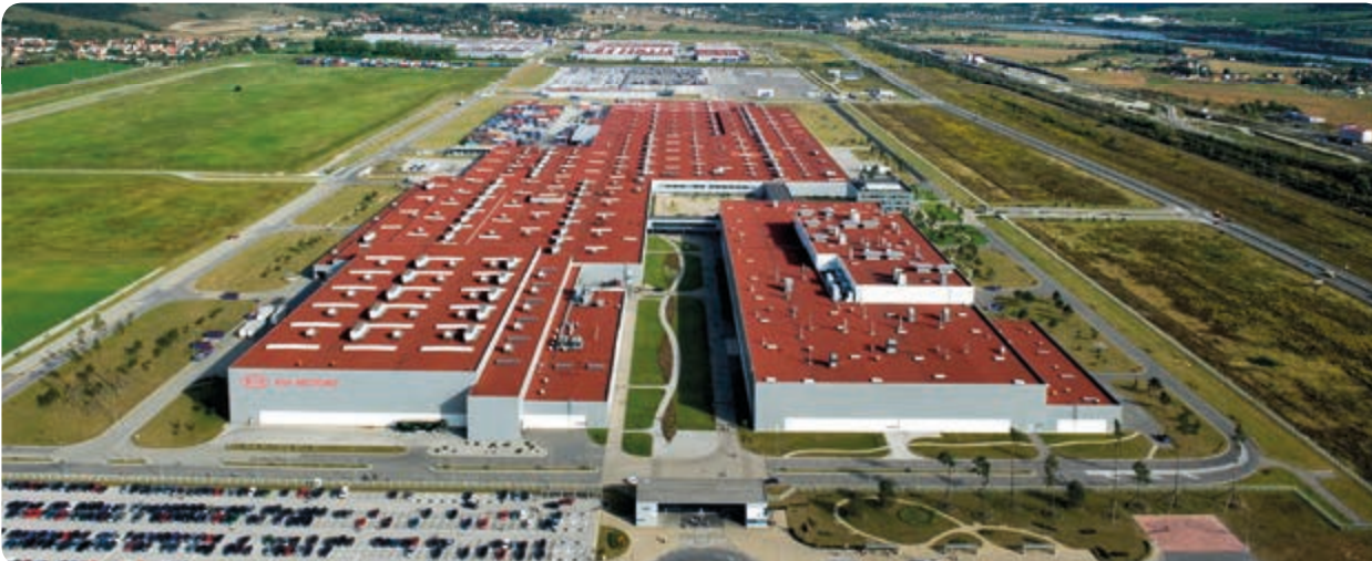
Kia production plant in Žilina, Slovakia