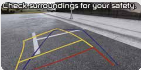
Rear parking assist system with rear view camera and dynamic guidelines The rear view camera projects dynamic, bending guidelines through the 7-inch LCD floating touchscreen to make parking a breeze.