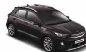
Aurora Black Pearl (ABP)